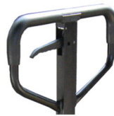
Rubber Protected handle